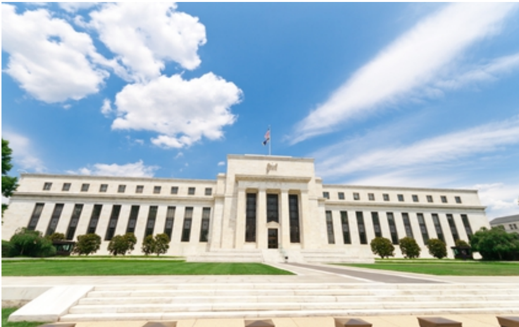
The Federal Reserve Will Own Mortgages

It is important for you to pay off your house mortgage. If you have the funds available pay off your mortgage because when the economy crashes you may no longer have the income in order to pay your mortgage. The Federal Reserve own your home, they have been putting $40 Billion every month into mortgage backed securities. They have been doing this since 2008. It is now 2013, so 5 years of buying $40 Billion of mortgage backed securities every month would equal around $2.4 Trillion in mortgaged backed securities. The total value of the outstanding mortgage debt market in the US is $13 Trillion. Therefore, the Federal Reserve directly owns just-under 10% of the mortgage market. However, you have to understand that banks, pension funds and investment companies own the rest and when the economies of the world are deliberately crashed, all of these banks, pension funds and investment companies will also fail. The result is that the Federal Reserve will have to take them over. So eventually if it isn't already, your mortgage will be owned and controlled by the Federal Reserve. Incidentally, the Federal Reserve controls all banks who must ask permission to do certain things. Therefore, if they have that much control over what banks such as J.P. Morgan are doing then it is possible that these banks are doing the Federal Reserve's bidding in the markets to manipulate the gold and bond prices to keep the game going that little bit longer.