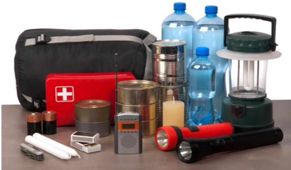
Store Food, Water and Firearms

The elite do not want you prepared, they consider those that store more than 7 days of food and water or who grow their own food as extremists. This is confirmed by the Department of Defense. The elite want you totally dependent on them and during the coming collapse many will not be prepared. Those who read this e-book will have the necessary basic understanding that will allow them to survive through this global collapse.