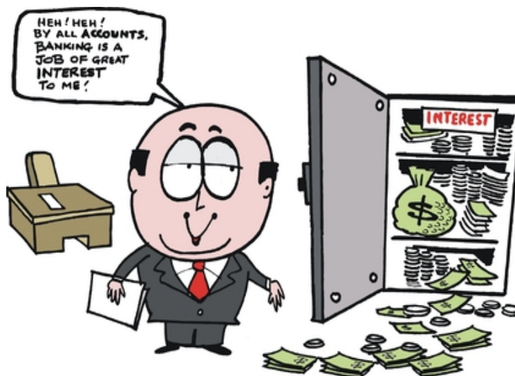
The Elite Are Only Interested In Interest

Pastor Williams has said that the crash will be linked to the derivatives market. He said that the derivatives market will be used to collapse the currencies of the world with interest rates. When the elite carried out the test in June 2013, the global derivatives market suffered within 7 days a staggering $300 Trillion ($300,000,000,000,000) loss. The Federal Reserve itself lost $151 Billion ($151,000,000,000) in bond values because of interest rates going up for 3 days. At the same time with the manipulation gold was suppressed and dropped to virtually cost price at around $1,200 an ounce. If gold had been allowed to sky rocket, the elite may not have been able to contain their test and the economies of the world would have crashed.