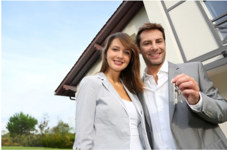
Buy Real Estate For Pennies On The Dollar

This is why after the dust settles those who buy gold now will be ready for the biggest buying opportunity of their lifetimes. If you buy gold now your wealth is secured against hyperinflation. Gold usually never goes up or down in value, it merely secures your purchasing power. If the American dollar crashes like you've never seen it crash before and a loaf of bread rises from $1 to $100, you will still be able to buy that bread, because your gold would have risen in value to balance out the hyperinflation. That loaf at $100 would be still worth the $1 when sold at today's prices. However, with scarcity and people not able to buy gold its value will rise exponentially. Those with gold will be able to buy whatever they want for pennies on the dollar.