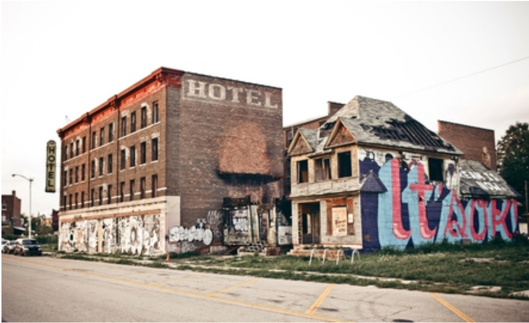
Destruction Of Cities Like Detroit Will Happen Throughout The USA

Just look at what happened in Detroit, a city spread out for over 142 square miles. When the vehicle manufacturers left the city it completely disintegrated. When a few major employers left the city crumbled and still has not recovered. With high unemployment the city was left with a reduced tax base, depressed property values, abandoned buildings, abandoned neighborhoods, high crime rates and a pronounced demographic imbalance. If you think of Detroit multiplied over a large number of cities in the US that is what will happen during the crash. The elite want as many people as possible on welfare, because when they are on welfare they are directly in control of them. Remember what I said about those on low incomes who received homes from the state in the UK having to move or pay extra for any additional bedrooms. This is the elite showing who's boss. The elite want more business failures, more failures of cities like Detroit and definitely want to bankrupt a lot of large corporations.