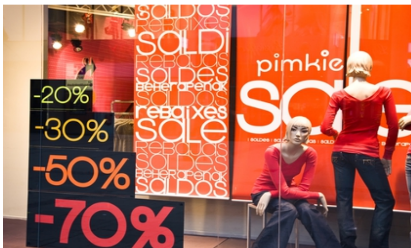
Get Ready For The Biggest Buying opportunity Of Your Lifetime

Do you want to lose everything, feed your family from a soup line and have to beg the government for the things you need? I don't and neither should you. If you follow the advice laid out in this e-book you have the opportunity to not only survive the collapse, but even thrive during and after it. The sacrifices to your lifestyle that you make now will be repaid ten-fold.