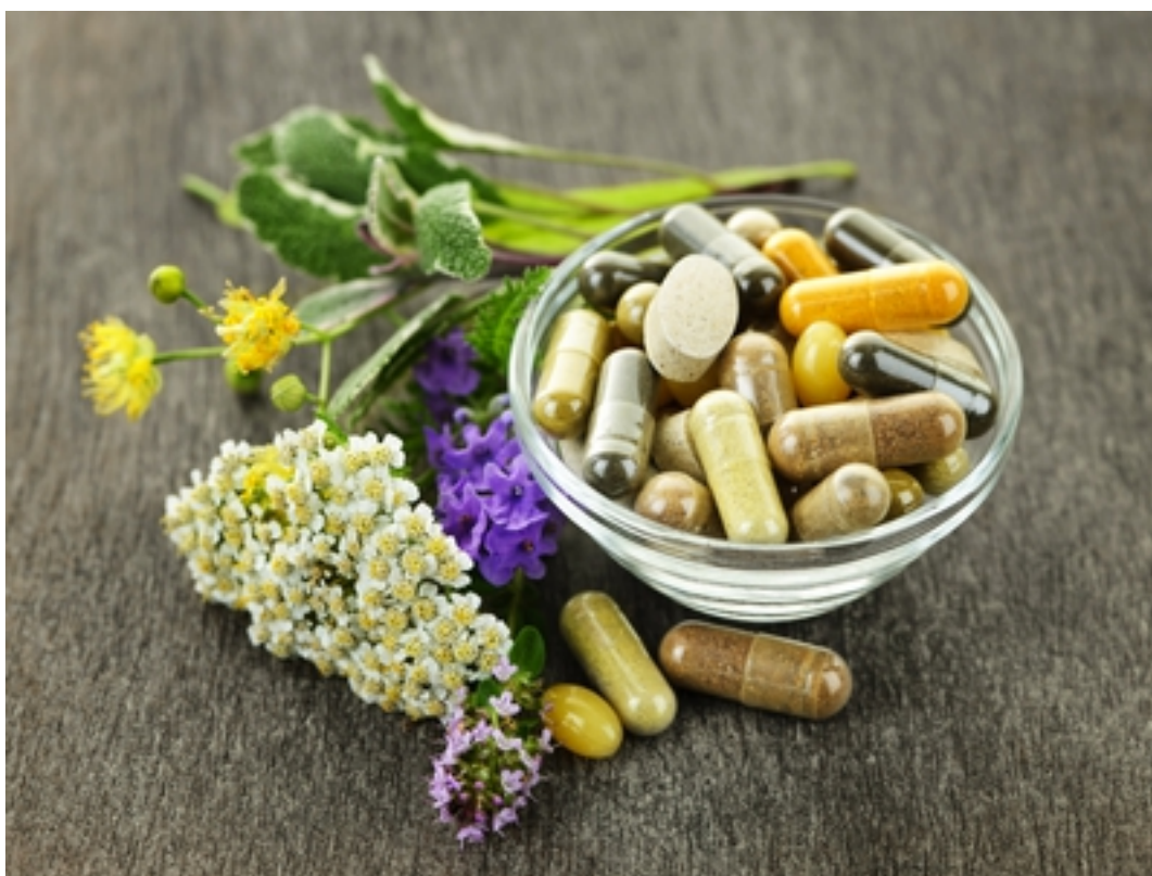
Sort Out Your Medicine Cabinet