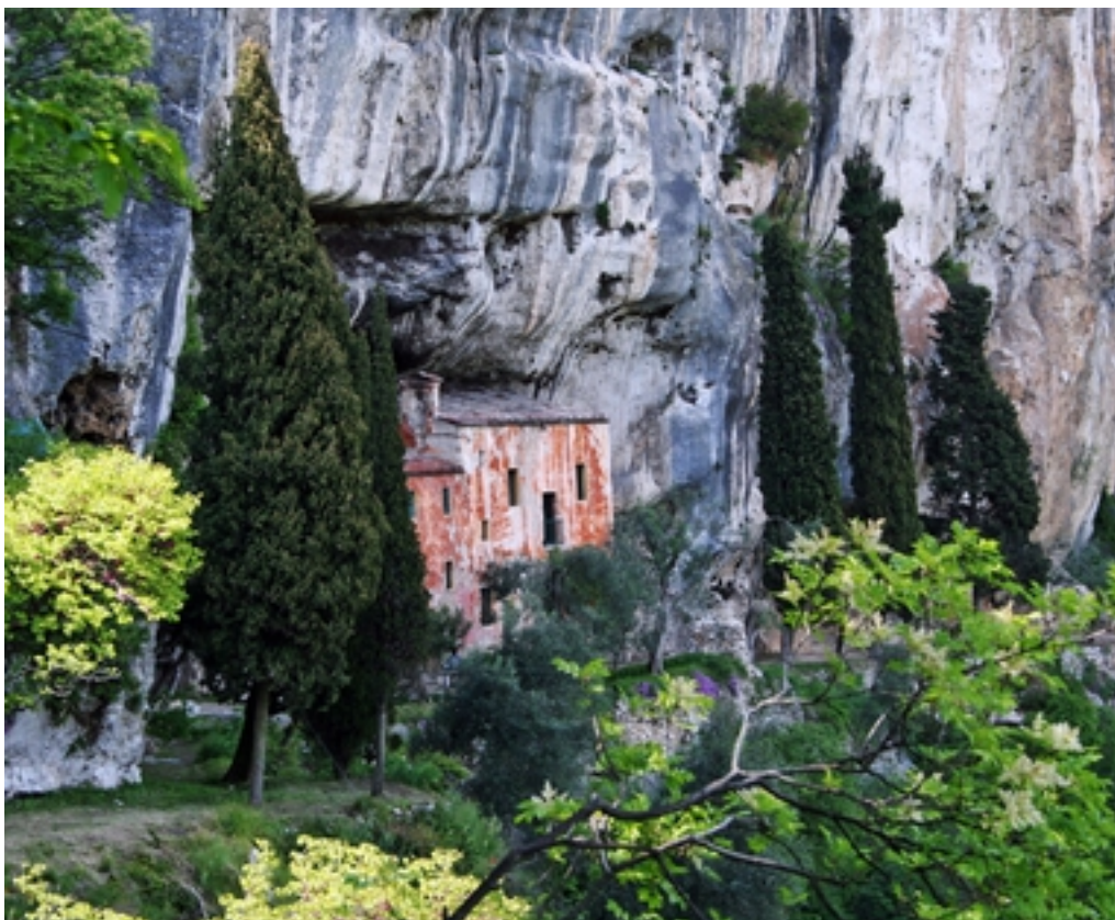
You Have To Get Out Of The City