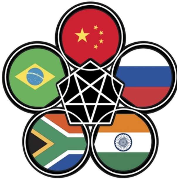
BRICS Group Symbol

The BRICS group are creating a development bank to rival the IMF. The world's leading emerging economies have reached a deal to create a development bank that will rival Western-backed institutions such as the International Monetary Fund and World Bank. Brazil, Russia, India, China and South Africa and all the smaller nations that have sought refuge under their wing will be used to encourage trade and help countries in times of financial crisis. They know what is about to take place and are already making preparations to combat the collapse of the American dollar as the reserve currency. It has been said that the new BRICS development bank will be gold backed and therefore they will start buying and hoarding as much gold as they can. Will this cause gold to rise in value? Of course, as I stated earlier in this e-book the elite are already struggling to keep the price of gold down. Ultimately when gold hits $2,000 an ounce you will see every investor and hedge fund manager dump the dollar like crazy and buy gold to try and stave off bankruptcy. But, by then all the gold vaults will be empty and guess who would control the majority of gold extraction? Yes, the BRICS group. Act now and you can benefit from the crash of all crashes.